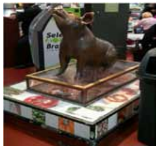
The ever popular “Philbert” at Reading Terminal Market, Philadelphia

I was quite excited to attend ACRL’s national conference in Philadelphia, PA, as well as participate as a panelist in one of ACRL’s workshops, https://acrlartofpresenting.wordpress.com/ .