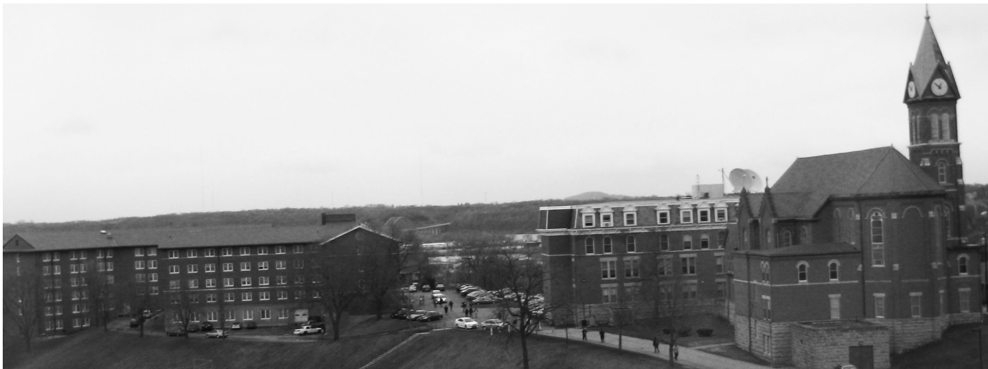
Loras College, where the Midwest ILL Conference was held

The second Midwest Interlibrary Loan Conference was held April 11, 2008, on the beautiful campus of Loras College in Dubuque, Iowa. Turnout was very good, with 90 attendees representing eleven states. Some attendees came from as far as Vermont and Arizona.